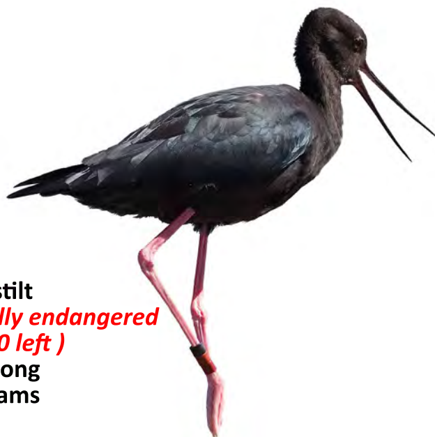
Black stilt Critically endangered (just 70 left) 40cm long 220 grams